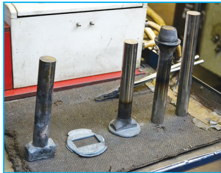
Figure 1 – bolt head hot forging sequence from right to left

Smith Bullough wanted to hot forge a rectangular bolt head, 2.25 x 1.25 x 0.98 (inches) from a 1.25 diameter bar of EN24 material. The forging temperature was 1,200°C obtained by induction heating and the process was carried out on a 125 tonne double blow press.