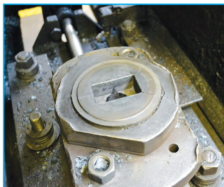
Figure 3 – bolt head die showing corner cracking

As shown in Figure 1, the sequence of operations consisted of preforming, forging and trimming. An example of the forged head obtained is shown in Figure 2.