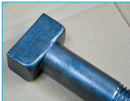
Figure 2 – formed, trimmed and machined bolt